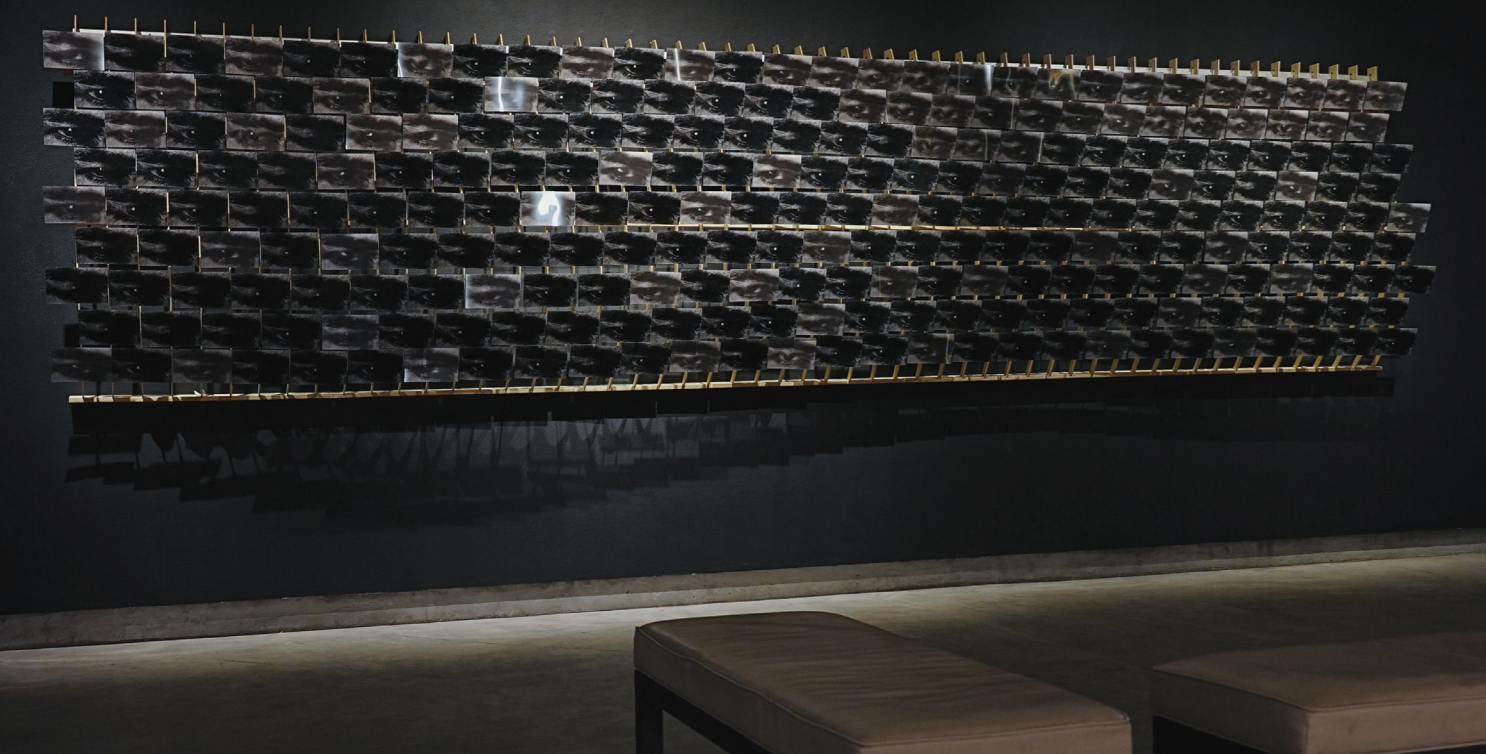
"300 Vigilant Eyes," 2022. Parametric wall sculpture, 600 pieces. 4.92' X 19.69'.