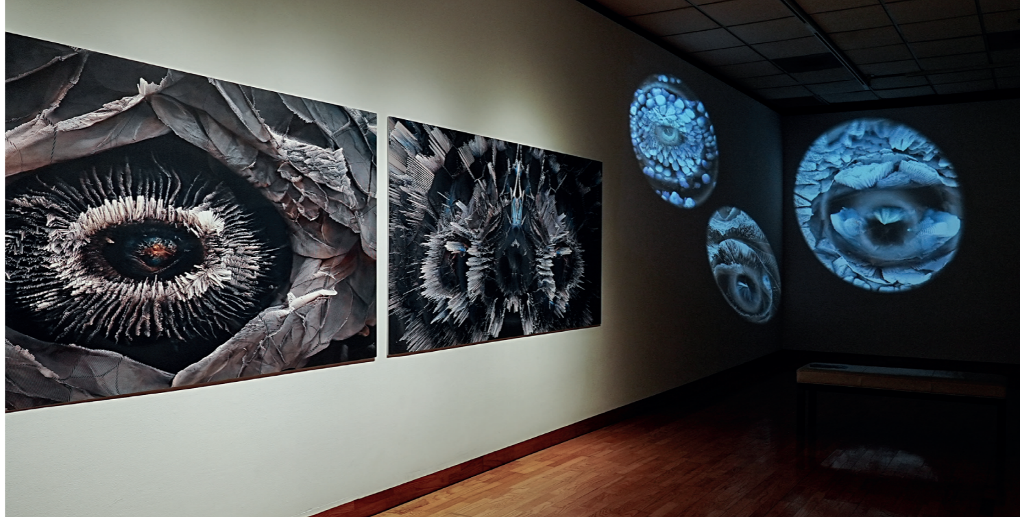
"Pervasive Surveillance 5 & 6," 2022. Gyclée print, 47.25"X 86.61."Agents of Surveillance," 2023. 3D Animation, 3'.